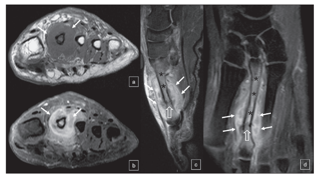
Figure 1. MRI of the left foot. Gadolinium contrast-enhanced axial T1weighted MRI sequence ( a ), together with axial, sagittal, and coronal T1weighted MRI sequences with fat suppression ( b , c , and d , respectively), showing a diaphyseal fracture of the second metatarsal (open arrows) and extensive fluid collection with peripheral contrast enhancement of the surrounding tissue, indicating an abscess (arrows). Note the bone marrow enhancement, suggestive of osteomyelitis, in the second metatarsal (asterisks).

dysfunction, impaired phagocytosis, impaired chemotaxis, and the use of immunosuppressants. Apart from appropriate imaging studies, patients suspected of having osteomyelitis should always undergo a complete sepsis workup, including blood, urine, and stool cultures. Staphylococcus aureus infection and opportunistic infections such as those caused by Salmonella spp. should be considered, as should tuberculosis in regions where it is prevalent. In the majority of cases, osteonecrosis is asymptomatic and occurs early in the course of the disease<sup>(4)</sup>. MRI is an excellent method for evaluating and diagnosing musculoskeletal disorders<sup>(6–10)</sup>, particularly complications related to bone fractures and osteonecrosis, thus allowing major sequelae to be avoided<sup>(2-5)</sup>. T1-weighted sequences with fat suppression after gadolinium administration, demonstrating soft tissue fluid collection with peripheral contrast enhancement, are essential for the diagnosis of abscess and osteomyelitis.