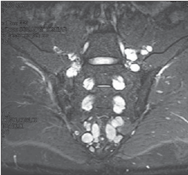
Figure 1. Lumbosacral column MRI showing isointense ovoid and elongated images on T1-weighted, and hyperintense images on T2-weighted and STIR sequences. The lesions vary in size and are located at the level of the neural foramina, with extraforaminal extension.

and lumbosacral) was performed for investigation. Dorsal and lumbosacral MRI demonstrated the presence of isointense nodular lesions at T1-weighted sequence, and hyperintense nodular lesions at T2-weighted and STIR sequences. Major lesions measured 2.1 cm, and some of them were in communication with the neural foramina (Figure 1). A similar finding was observed in the muscle structures, neurovascular bundles and on the skin plane of the dorsal lumbar re-