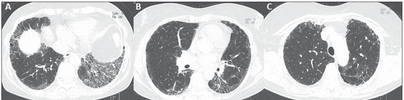
Figure 1. HRCT of the lower (A), middle (B) and upper (C) thirds of the lung.

A female, 58-year-old patient with muscle pain in upper and lower limbs associated with mild dyspnea and bibasilar stertor was referred to the imaging center to undergo high-resolution computed tomography (HRCT) (Figures 1, 2 and 3).